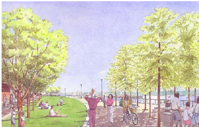
Sketch of the southern view of the park